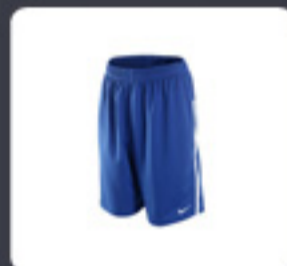
Pro Core SL Tight