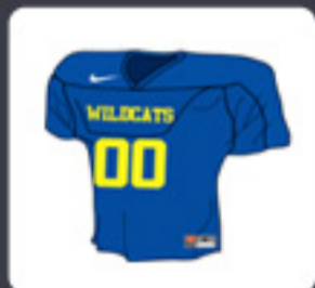
Core Practice Jersey