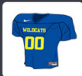
Core Practice Jersey