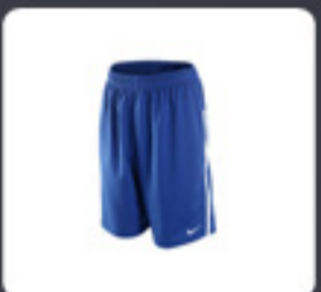
Pro Core SL Tight