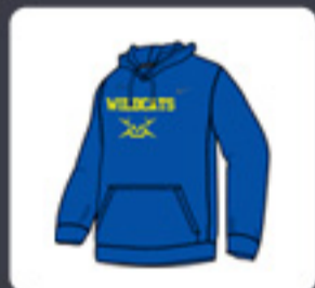
NIKE KO Hoody