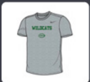
Pro Core SS Fitted Crew