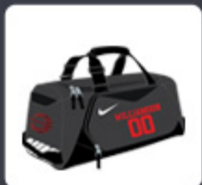
NIKE Training Medium Duffel