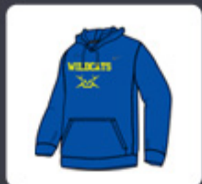
NIKE KO Hoody