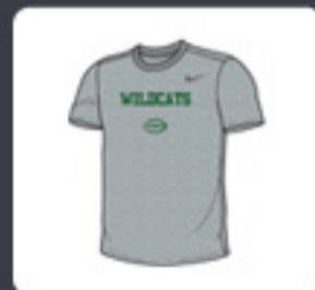
Pro Core SS Fitted Crew