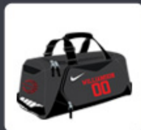
NIKE Training Medium Duffel