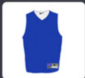
Reversible Mesh Jersey